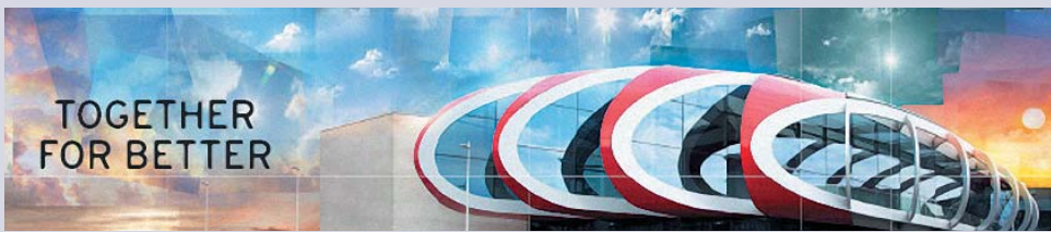
Lead architect: Ron Arad - Executive architect: Jaspers & Evers