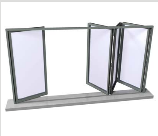
New Concept Folding Solution

Duffel, June 2010 --- Reynaers Aluminium, a leading European provider of high-quality, innovative sustainable aluminium systems, now enhances its established range of architectural offerings with its advanced CF 77 folding system. This solution is not only technically state of the art, but also aesthetically pleasing and versatile.