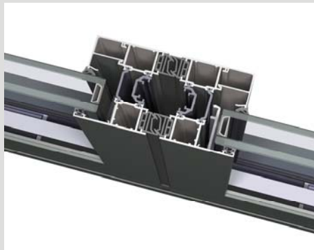
CF 77 – Functional

Next to the functional design, the CF 77 is supplemented with a Slim-Line variant, the CF 77-SL, featuring a narrower visible width. The CF 77 allows substantial transparent constructions with a maximum height of 3 meters and vent width of up to 1200 mm, allowing vent weights of up to 120 kg. Different designs in handle options are available.