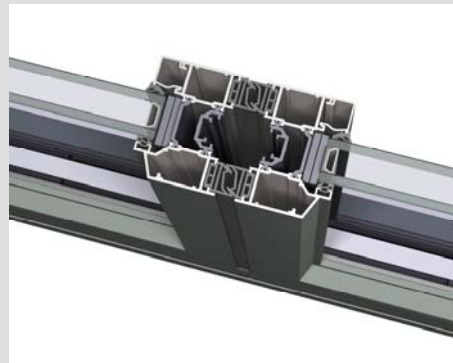
CS 77 – Slim Line

An optional door locking principle allows users to use the first leaf either as an entrance door or as a window without negatively affecting the folding capability of the system. With the CF 77 there's a broad variety of configurations to choose from. The CF 77's versatility allows fabricators the benefit of installing the system to open either in- or outward with the same profiles and accessories. With its limited number of profiles and innovative locking mechanism, the system can easily be adjusted and assembled on site.